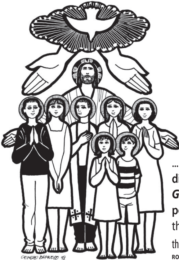
CERRO BARRETO '98

February 5, 2012 Fifth Sunday After Epiphany 8 & 11 a.m. Traditional Worship Service KELO 1320 AM Radio Broadcast 9:05-9:55 a.m.